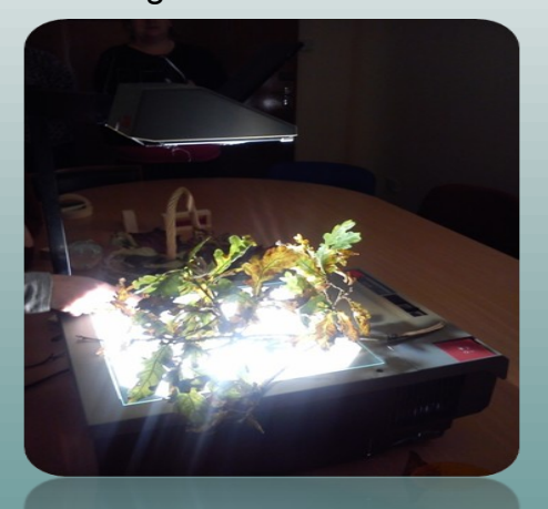
Playing with light and Nature