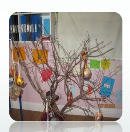
Our Sound Tree

With this in mind SCCC delivered training for Afterschool childcare services which introduced Aistear into the Afterschool arena for staff working in this area.