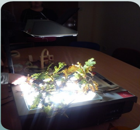
Playing with light and Nature