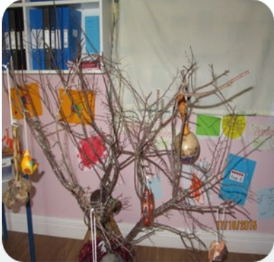
Our Sound Tree

With this in mind SCCC delivered training for Afterschool childcare services which introduced Aistear into the Afterschool arena for staff working in this area.